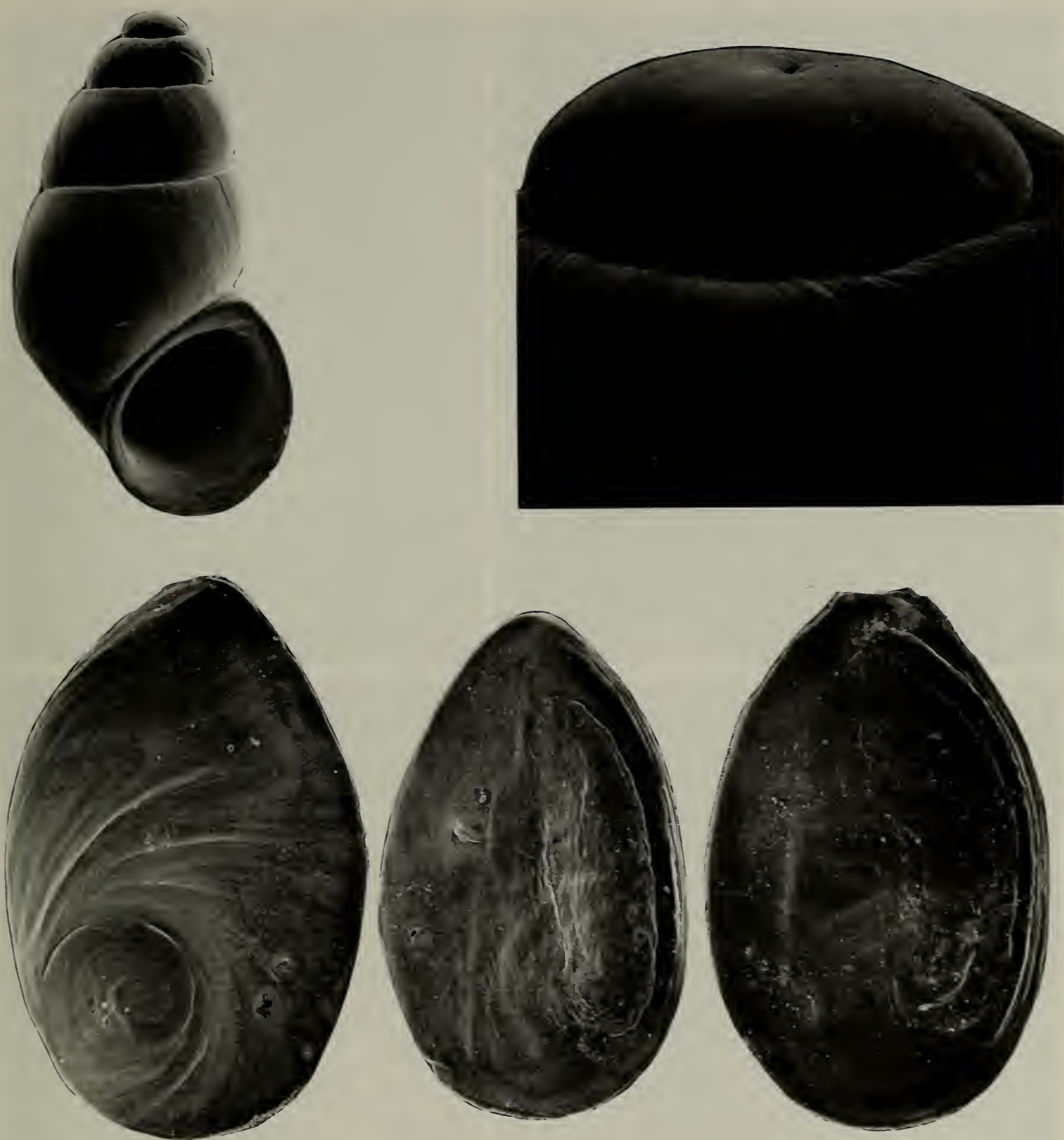
Fig. 2. Scanning electron micrographs of shell and opercula of A. sketi , USNM 860575. a. Shell (height, 2.1 mm). b. shell apex (bar = 100 \mu\text{m} ). c. Operculum, dorsal surface (bar = 176 \mu\text{m} ). d, e. Operculum, ventral surface (bar = 200 \mu\text{m} ).

scarcely extending beyond edge of well-developed buccal mass and without posterior coil. Central teeth (Fig. 3a, b) trapezoidal, with well indented dorsal edge; lateral angles narrow, slightly thickened, well expanded and sometimes broadened distally. Lateral cusps of central teeth narrow, 4–5; central cusp slightly longer than laterals; basal cusps moderate to long, arising from